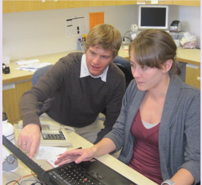
Idaho State University Family Medicine Residency